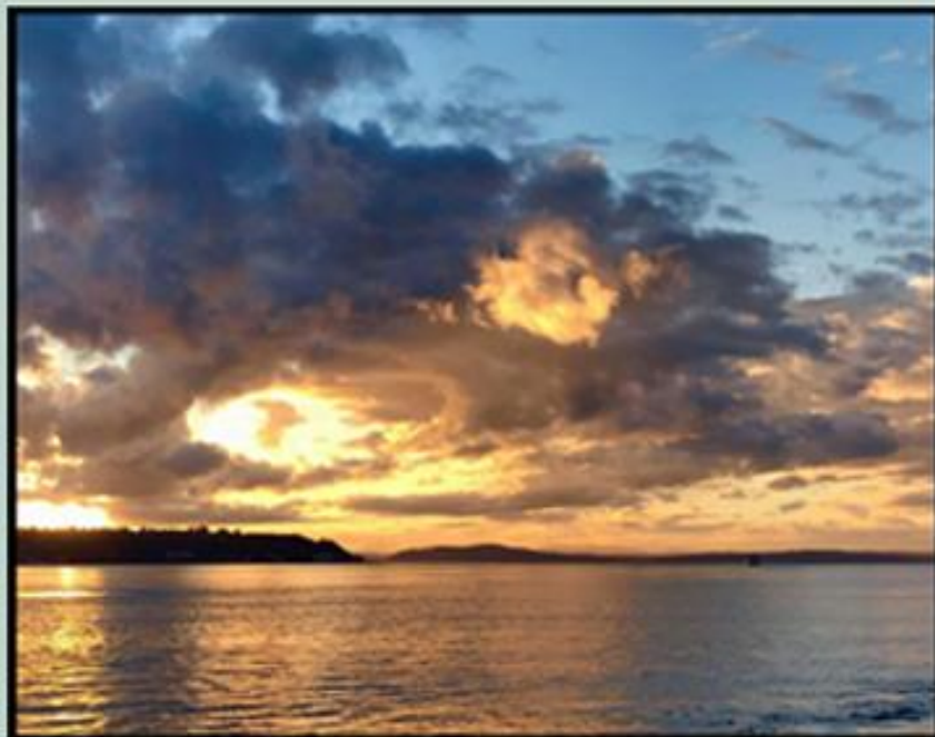
June 18 Image

June 18 and 19 - 10 am to 1 pm 2 sessions - $50.00 a session.