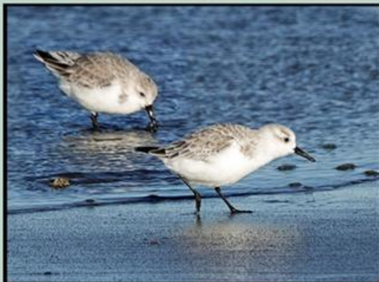
June 19 Image

Register at: The Gallery of Ocean Shores or Phone: (360) 289-0734